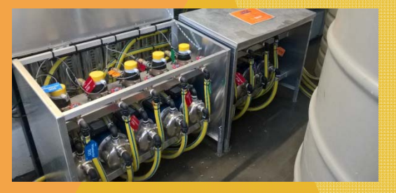
8x MES20 admixture flowmeters Install at Premix Concrete plant