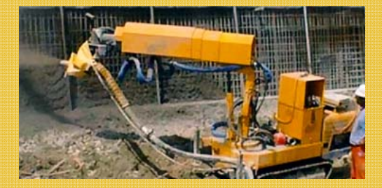
ManuFlo Flowrate indicator flowmeter Installed on a shotcrete spray rig.