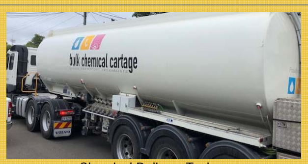
Chemical Delivery Tankers